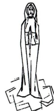
Pray the Rosary