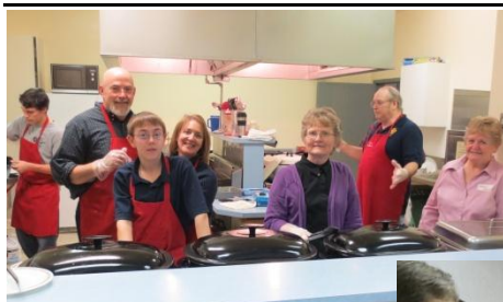
BREAKFAST FUNDRAISER AT THE KC HALL