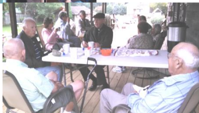
Coffee on the Deck