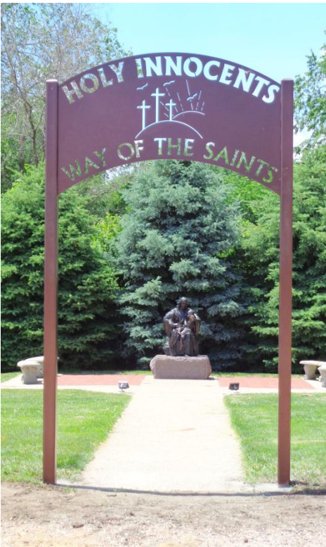
Arbor framing the statue of "Jesus and the Children" in the Holy Innocents Garden.

Rocks have found a place in many situations in early Christian life. Saint Stephen, the first Martyr, was stoned to death; David slew Goliath with a stone....and so on. At the Shrine, rocks have been collected, and a wall is about to take shape.