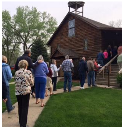
Hail Mary Full of Grace!!